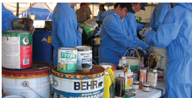
Above: Workers sort through and dispose of toxic household products at the Spring 2009 Fairgrounds Pollutant Collection.

tribute to Tulsans becoming more environmentally conscious."